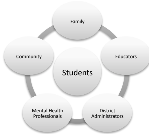
Figure 1. Collaborative partnerships

Note. The figure does not denote a hierarchy but a mutual relationship.